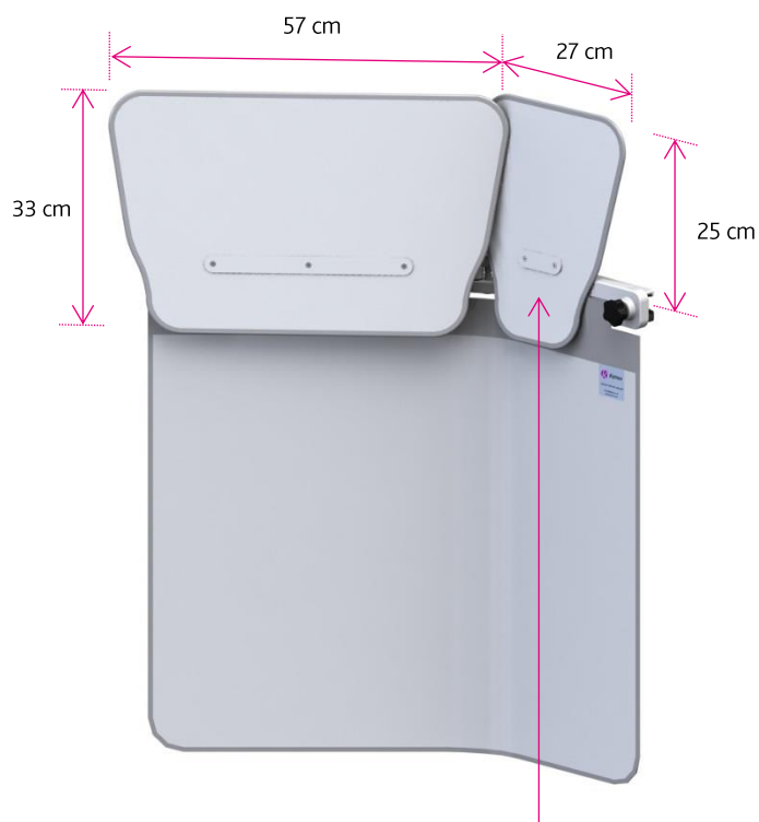
Optional top shield 312/DS/3.30 Weight: 0.9 kg